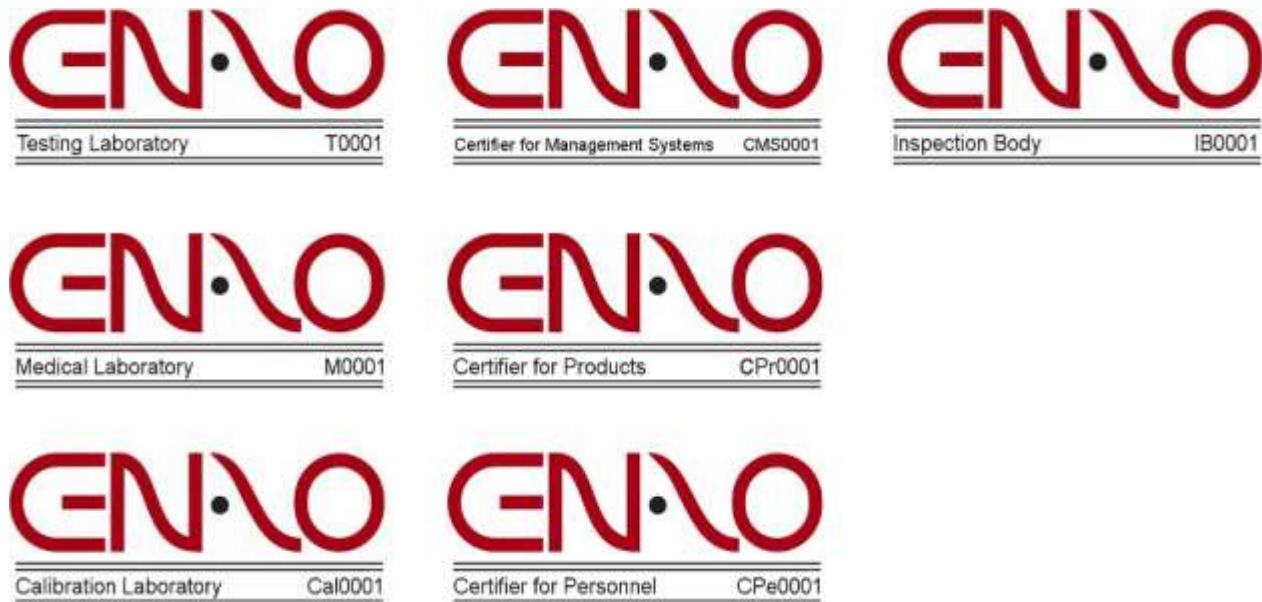
Figure 2: Versions of the accreditation symbol used by accredited CABs depending on the type of accreditation that was granted.